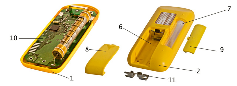
Figure A.2 – Rear view with the removed lid